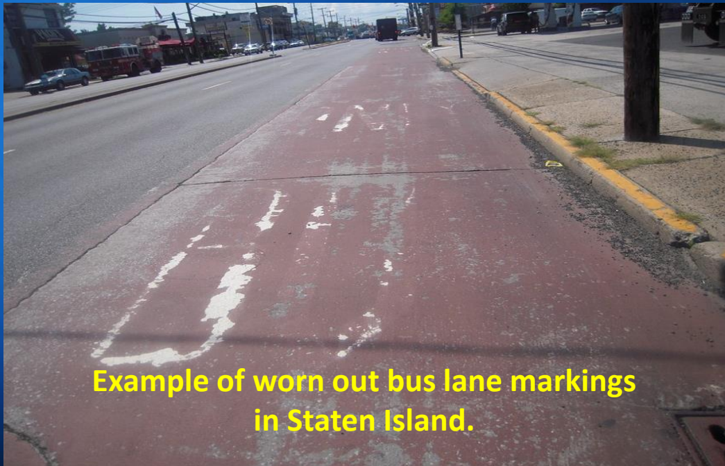
Example of worn out bus lane markings in Staten Island.