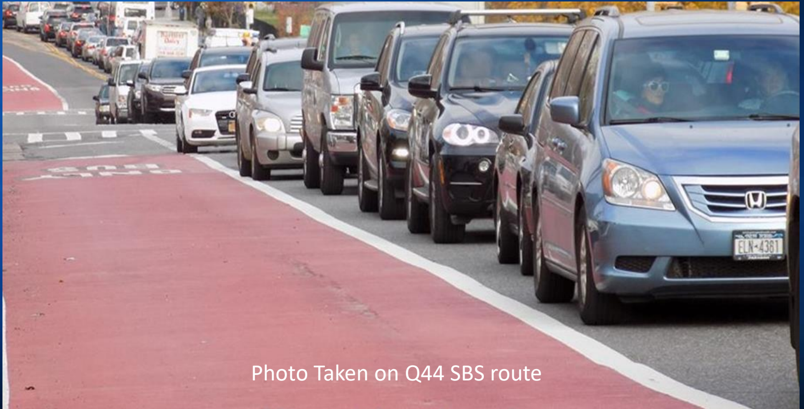
Photo Taken on Q44 SBS route